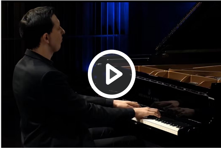
Warsaw Philharmonic: Bach, Beethoven, Chopin, Prokofiev