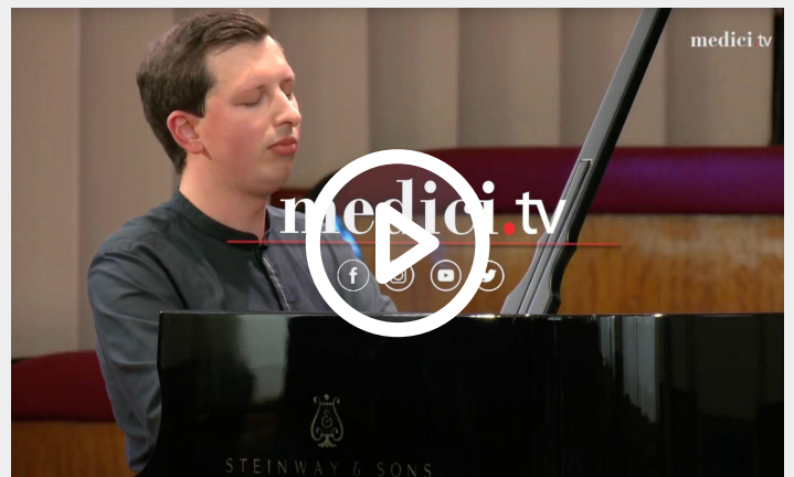
Franz Liszt: Années de pèlerinage, première année – Suisse, S160